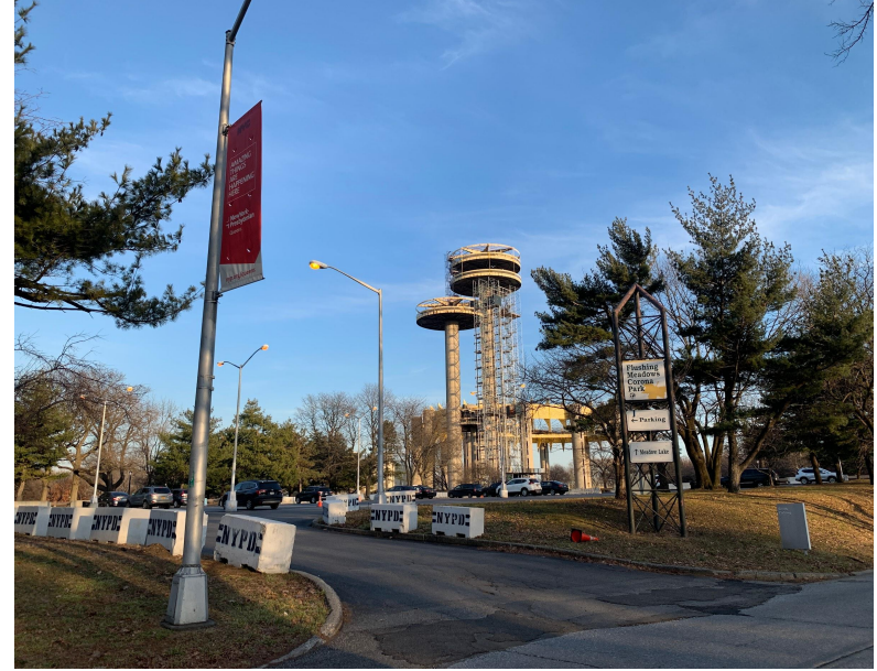
Parking lot to the right of the building (South)