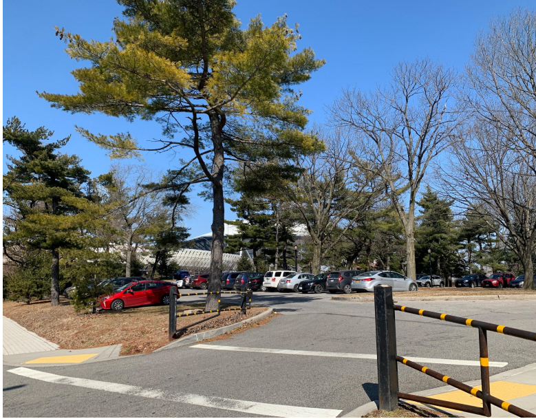
Parking lot to the left of the building (North) **closest to the entrance**

The Queens Museum also has two free parking lots near the Grand Central Parkway entrance, on either side of the Museum.