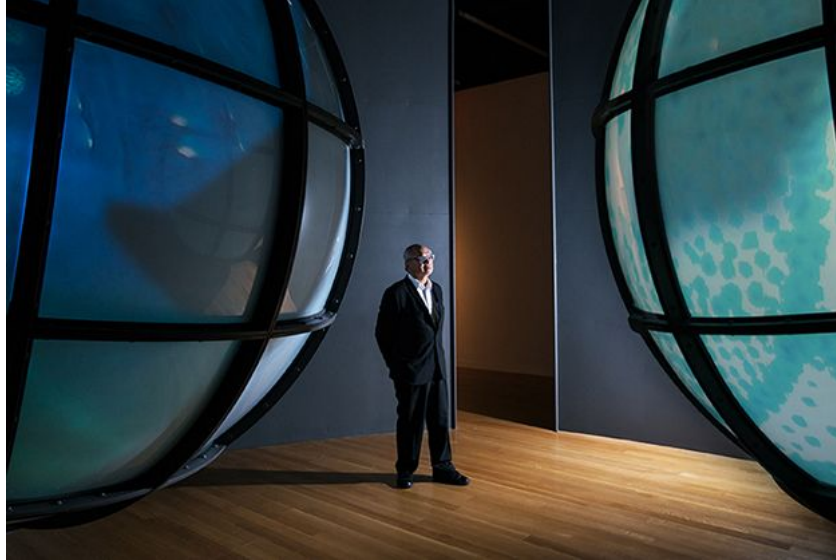
Mel Chin and his installation Sea to See (2014).

All Over the Place is not organized chronologically, but attempts to contend with Chin's intricate conceptual thinking, layered processes, and practical instincts through four sections that group works according to affinities and interrelations. These four sections contain both long-term collaborative works and stand-alone sculptures.